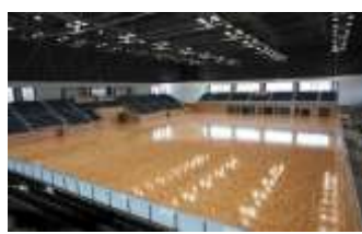
A new sports base in southern Fukuoka “Kurume Arena” opened June 2, 2018

Kenya and Kazakhstan is selected to Pre-camp for Tokyo Olympics and Paralympics 2020