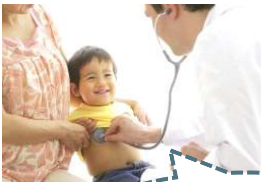
Number of pediatricians and obstetricians Nationwide top class