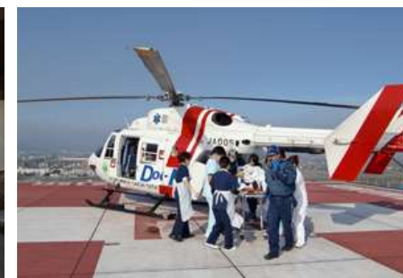
Relief in case of emergency Doctor Car · Doctor Helicopter